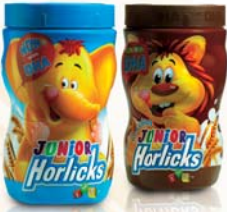
Junior Horlicks World Star Award Winner

Over the years, IDE has built a reputation for balancing creativity with practicality in designs through its astute combination of designers and engineers.