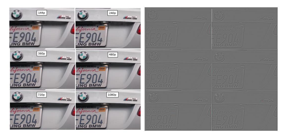
Figure 1: High pass filter yielding edge detection in the spatial domain

Compressed domain <u>techniques</u> can turn out to be more efficient than pixel-based ones. In some cases, like the subjective quality assessment, they may be the only practical choice too.