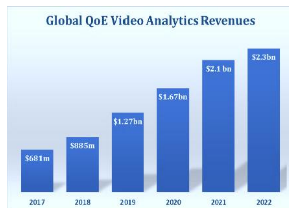
Figure 2: Global QoE Analytics Revenue, Rethink research, March 2018

Inspired by the agile methodology, the next phase or current attempts of video QoE analytics is to reduce the turnaround time of and first time quality delivery. This helps define a left shift strategy for video QoE assurance and makes sure the system is QoE benchmarked and tested before it is released to the customer. This process involves a non-eye ball test mechanism and powerful QoE test automation capability.